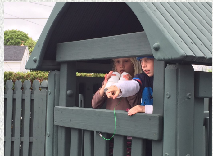
Two children view the seabird island from the blind with PVC pipe binoculars