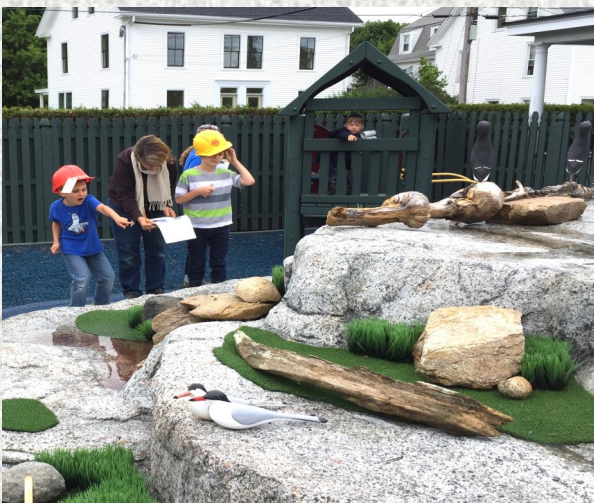
A parent guides her children in conducting a census.

Thanks to your donations, the seabird island exhibit at the Refuge's Visitor Center now includes all the trappings of a real managed island. There you'll find a binocular-equipped observation blind, a sound system that broadcasts the cries of a real tern colony, and replicas of island vegetation, seabird nests and eggs, and the decoys used by refuge scientists to attract seabirds. We hope you'll bring your children and grandchildren to experience this family-oriented outdoor adventure. The youngest kids can hunt for seabird eggs and older children can become junior biologists and complete a seabird census.